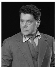
Sergey Makovetskiy Voynitskiy Ivan Petrovich

National Artist of the Russian Federation, Laureate of the State Prize of Russia, and Holder of the Order of Honour. With his magnetic combination of energy and skill, Sergey Makovetskiy is adored by the public, recognized and revered by critics and required by directors. He has appeared in dozens of films, in countless theater roles, and is the holder of over 30 Russian and foreign theater stage and screen awards.